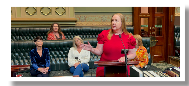
Speaking up to ensure our electorate is representated in Macquarie Street.

In Parliament recently I spoke of just some of the major achievements we have made since I was elected as the Member for Maitland in 2015. Some are still to be completed, and a couple were started before I got here, but I am proud of all of them. Thanks to my Federal and Local Government colleagues for their support on many of these, and thanks to the community for your support!